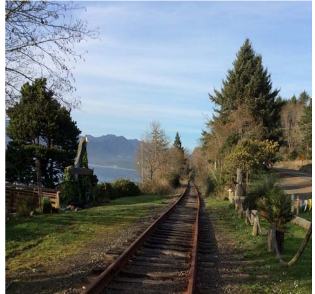
Port of Tillamook Bay rail line in Wheeler, OR Tillamook County, OR

Phase II - Phase II ESAs include environmental sampling (soil, groundwater, air) and analysis (risk assessment).